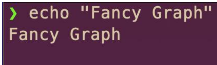
Figure 1 - Fancy Methodology Graph

Duis autem vel eum iriure dolor in hendrerit in vulputate velit esse molestie consequat, vel illum dolore eu feugiat nulla facilisis at vero eros et accumsan et iusto odio dignissim qui blandit praesent luptatum zzril delenit augue dui dolore te feugait nulla facilisi. Lorem ipsum dolor sit amet, consectetur adipiscing elit, sed diam nonummy nibh euismod tincidunt ut laoreet dolore magna aliquam erat volutpat.